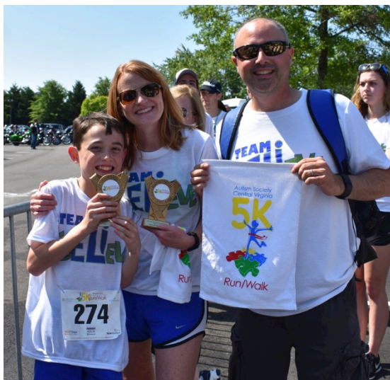
2017 Top Fundraising Individual and Top Fundraising Team

As you can see, there are numerous ways in which you can support the 16 th Annual 5K Run/Walk for Autism on May 26, 2018, and help the ASCV with our mission to improve the lives of ALL affected by autism in Central Virginia. We hope to see you there!