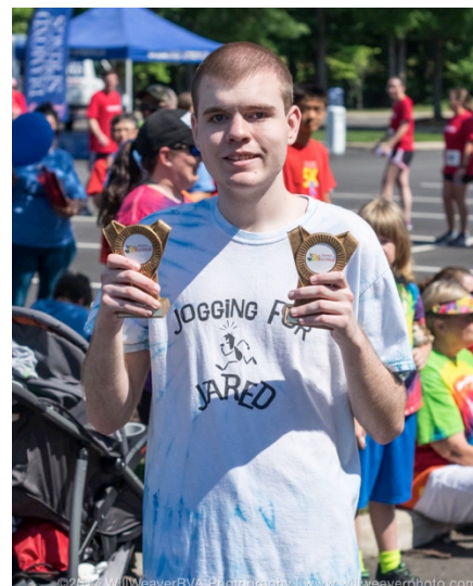
2017 Largest Team and Most Spirited Team