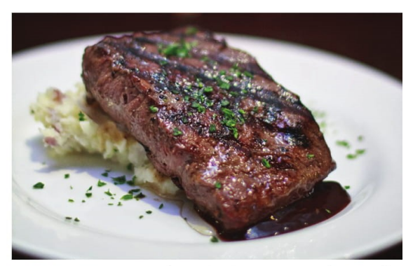
(Regularly priced at $17.90)

*Limit one per person. Drink purchase required. Not valid for carry out.